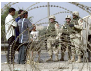
U.S. soldiers man a checkpoint Wednesday in the center of Baghdad.

BAGHDAD — Only a third of the Iraqi people now believe that the American-led occupation of their country is doing more good than harm, and a solid majority support an immediate military pullout even though they fear that could put them in greater danger, according to a new USA TODAY/CNN/Gallup Poll. ( Graphic: Iraqis surveyed )